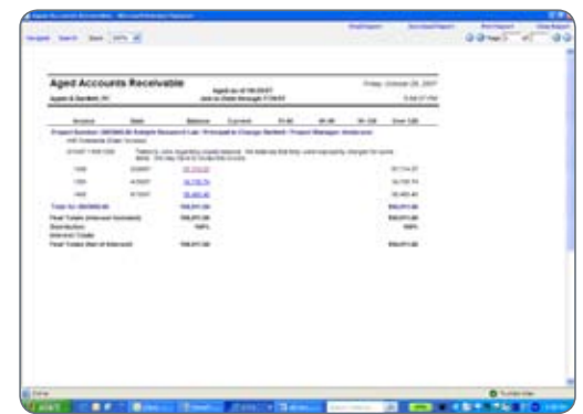
Figure 4: Vision's Aging reports and Aging Alerts keep you on top of outstanding invoices so you can improve cash flow