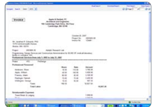
Figure 2: Vision Billing helps you prepare timely and accurate invoices so you can get paid more quickly

Universal access and zero-client install ensure that any user with Internet Explorer can access the system from anywhere at anytime. Other than a web browser, no plug-ins or applets are needed. Vision supports hundreds of concurrent users, yet can be readily scaled down to meet the requirements and resources of smaller organizations.